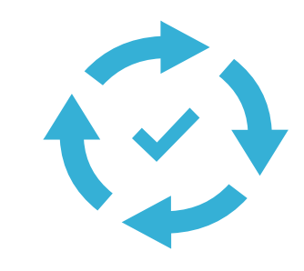
18 years in business